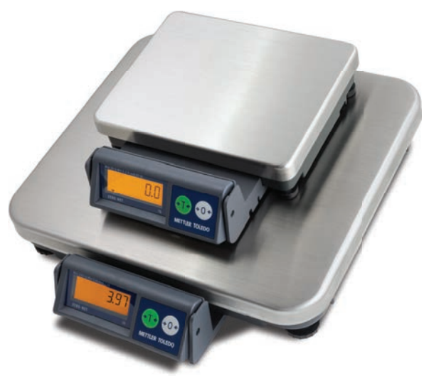
Ariva-S-Mini shown on top of Ariva-S

The Ariva-S-Mini standalone checkout scale is the METTLER TOLEDO checkout solution for retailers with the most stringent demands. The Ariva series for weighing at the register comprises weighing modules to be installed in bioptic scanners (Ariva-B), scales for integration of horizontal scanners (Ariva-H) and standalone scales without scanners (Ariva-S and Ariva-S-Mini).