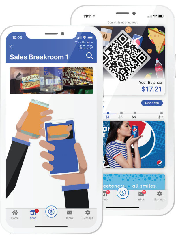
Need help? Please reach out to your operator for end user support.